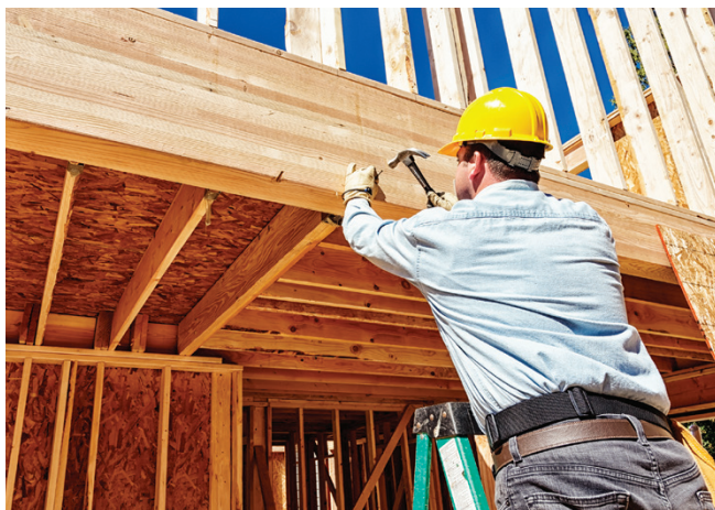
International Builders' Show February 19-21, 2019 • Las Vegas, NV Booth #SU1231

app for that! Yes, really! Download the IBS app* to your smartphone and let it be your guide to everything at the Builders' Show. To find RWC, simply type Residential Warranty Company in the app's search feature and you'll be directed to the link. There's even a map that will direct you right to the booth!